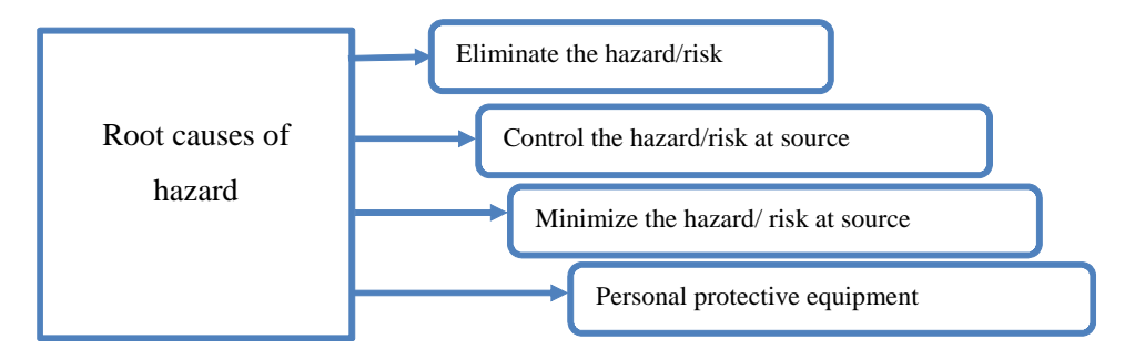
Fig. 2: Hierarchy of preventive and protective measures (adapted from Alli, 2008)

includes five dimensions, i.e. culture, evaluation, policies, finance, and task coordination.