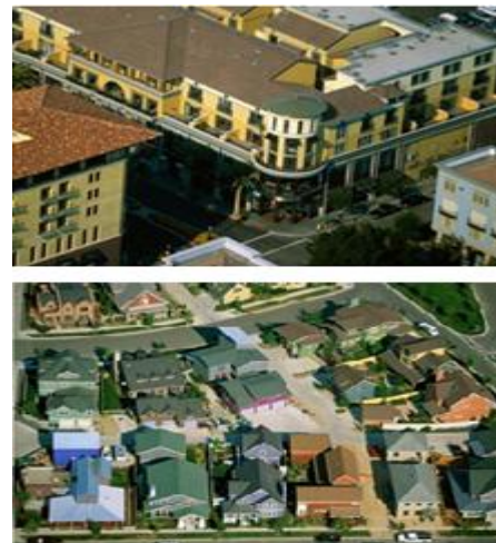
Fig. 2: Apartments allowed over shops and Garages located on alleys (Lincoln Institute)