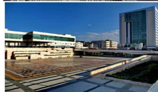
Fig. 4: Connectivity and walking in Shahid Beheshti square