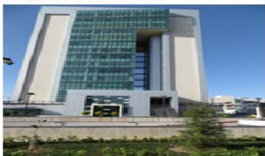
Fig. 3: Green Space in Shahid Beheshti Square